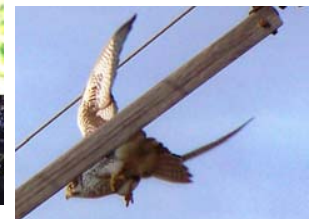
Charley Burwick: Prairie Falcon